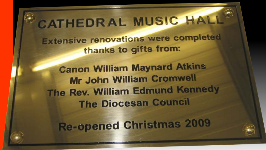
Engraved brass plaque - Cathedral Music Hall

☛ polished brass plaques offer a more traditional look and feel. popular for use as commemorative or memorial plaques in churches and old style buildings.