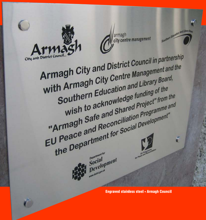
Engraved stainless steel - Armagh Council