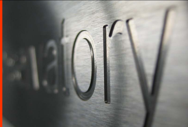
Engraved stainless steel frame - Armagh Observatory

engraved or etched plaques are a superb and classy way to celebrate or mark an event. whether it is an opening or naming of a building, office, park or centre you simply cannot do without an engraved or etched plaque.