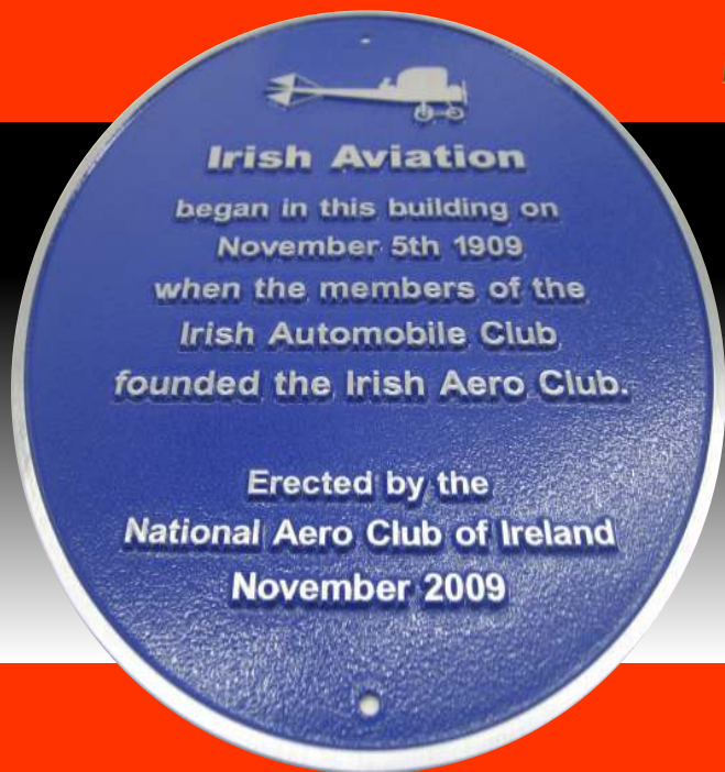
Acid etched plaque - National Aero Club of Ireland